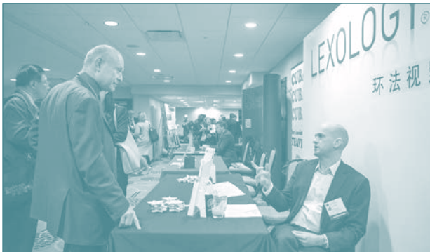
Exhibition Hall at the 2015 Spring Meeting