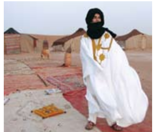
Tent camp in the desert